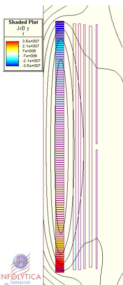
Force density [N/m 3 ] at first peak current